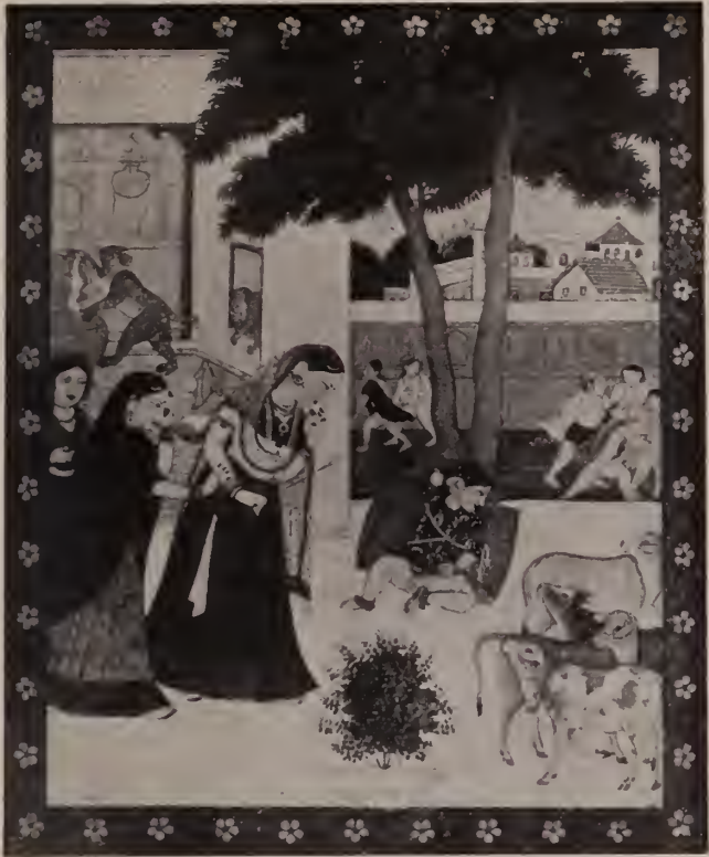
INCIDENT IN THE LIFE OF KRISHNA. KANGRA KALM (EIGHTEENTH CENTURY).